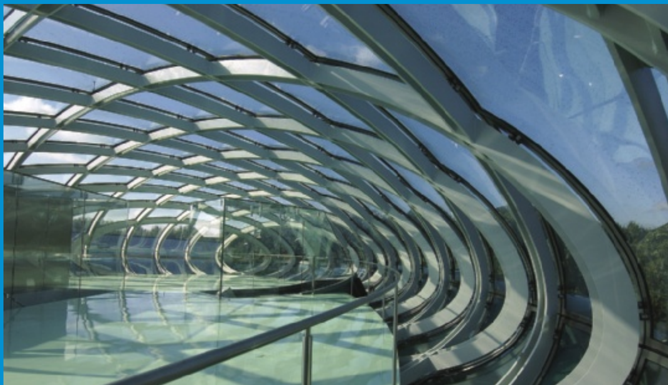
Sunergy Clear – “Bolle” Nardini distilleries research & event centre – Bassano del Grappa, Italy – Architect: Massimiliano Fuksas – Studio Fuksas