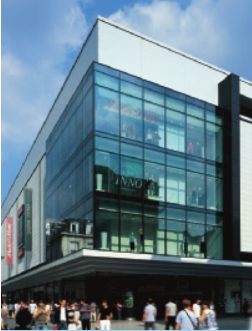
Sunergy Green ▲ Galeria Inno shopping center – Brussels, Belgium